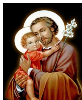
St. Joseph - 19th